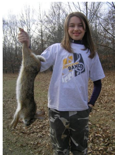
A Miller girl with a nice swamper.