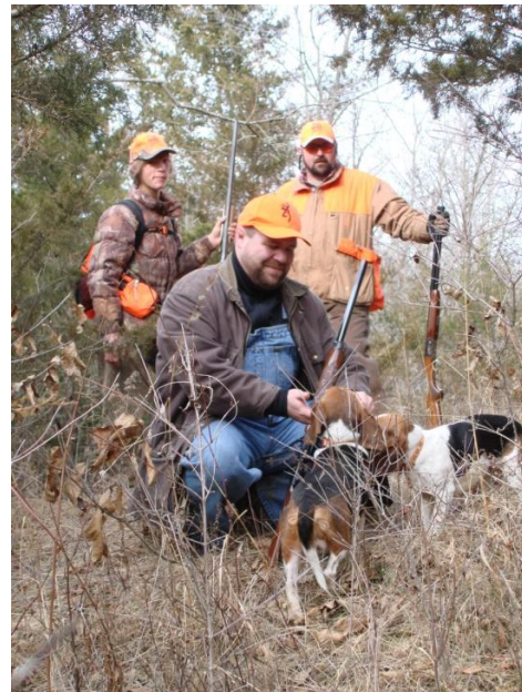
Hunting and trapping are essential to the Model.

Summary. These 7 tenets have formed a firm basis for successful wildlife conservation in this country. And, one theme is important to all of them – the role of hunting and trapping. Hunters first raised the conservation alarm bells that led to formation of the Model and continue to be the primary funding source for wildlife conservation. This is not only from sales of licenses, permits, and the 11% excise tax on