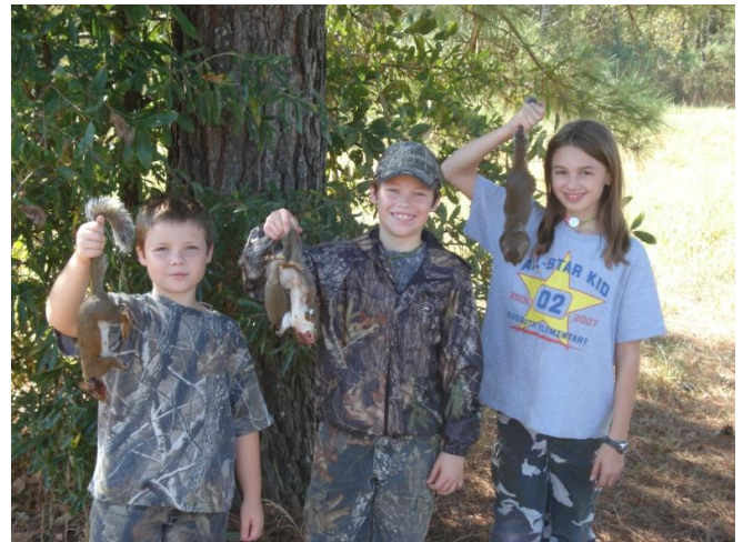
Small game hunting is a great way to introduce kids to the outdoors. Regardless of what is hunted, keep it safe, simple, and focused on the kids.